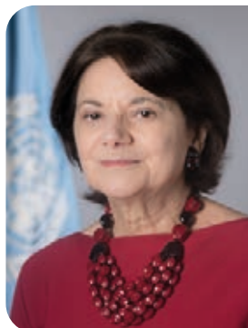
Rosemary A. DiCarlo Under-Secretary-General for Political and Peacebuilding Affairs

This joint effort illuminates the power and potential of dialogue and rights, and demonstrates that successful peacemaking embraces the fundamental rights of all parties involved, including those most marginalized. By integrating the mediation process with human rights considerations, we hope and aspire to increase the odds of reaching more inclusive and just peace agreements, which in turn, contribute to a more sustainable peace.