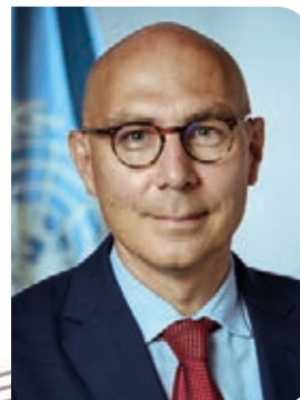
Volker Türk High Commissioner for Human Rights