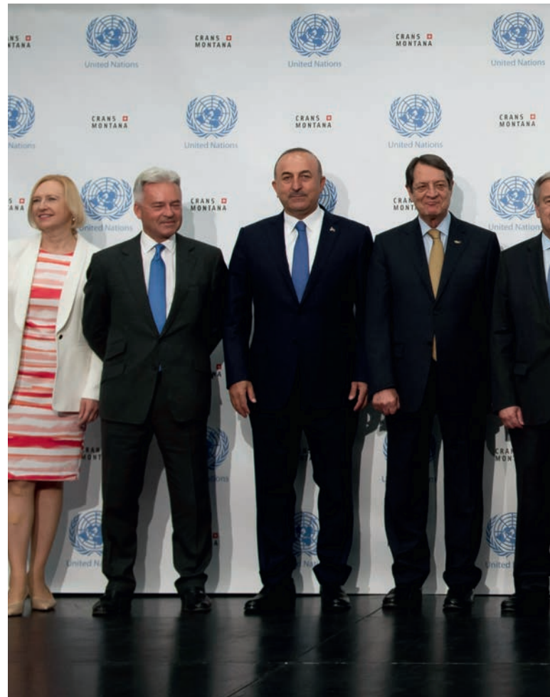
UN Secretary-General attends the Conference on Cyprus, Crans-Montana, Switzerland, 6 July 2017.

26. Fostering public support requires the building of trust. In the Republic of Moldova, for example, UNDP and the United Nations family have supported the official settlement process by engaging in development interventions across the security zone on both sides of the Nistru/Dniestr River. These efforts facilitate increased interaction and support the development of relations between the sides. Generating broad public support is often a challenging undertaking within a peace process, as illustrated by the case of Colombia, where the peace agreement reached between the Government and the Revolutionary Armed Forces of Colombia — People's Army (FARC-EP) failed to win approval in a plebiscite held in October 2016. Communications campaigns and initiatives entailing outreach to civil society, local authorities and the public, which aim at the sharing of information on the agreements and underscoring the tangible benefits of peace, remain important in the implementation phase and can benefit from continued United Nations support.