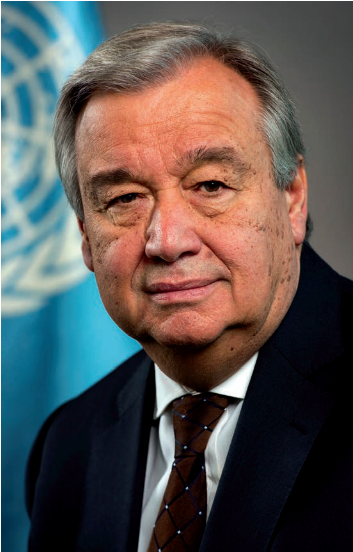
United Nations Secretary-General António Guterres.

1. In its resolution 70/304 of 9 September 2016, the General Assembly requested that the Secretary-General report to the Assembly at its seventy-second session on United Nations activities in support of mediation in the peaceful settlement of disputes, conflict prevention and resolution. The present report is submitted pursuant to that request.