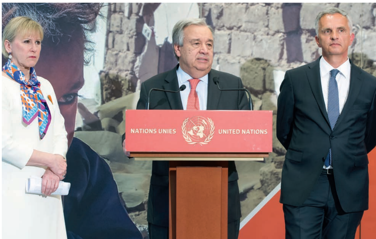
UN Secretary-General António Guterres speaks to journalists following the pledging conference for the humanitarian crisis in Yemen, Geneva, Switzerland, 25 April 2017.

and conflict prevention efforts have been funded through extrabudgetary resources (voluntary contributions from Member States) obtained through the Department of Political Affairs annual funding appeal. These resources have played a critical role in allowing the Department to complement core capacities as well as the resources of special political missions, in response to the shorter-term or programmatic needs that arise in the course of a mediation process. Emergency windows have been established, including fast-track procedures, which facilitate access to funding in the particularly critical start-up phase. Resources have also been drawn from my unforeseen and extraordinary expenses account. The Peacebuilding Fund, established in 2005 and managed by the Peacebuilding Support Office, funds activities in support of countries emerging from conflict. In addition, the United Nations funds and programmes have resources that may be channelled to support mediation activities. Mediation is also an activity in peacekeeping operations; MINUSMA, for example, has a Mediation Unit which provides support to my Special Representative.