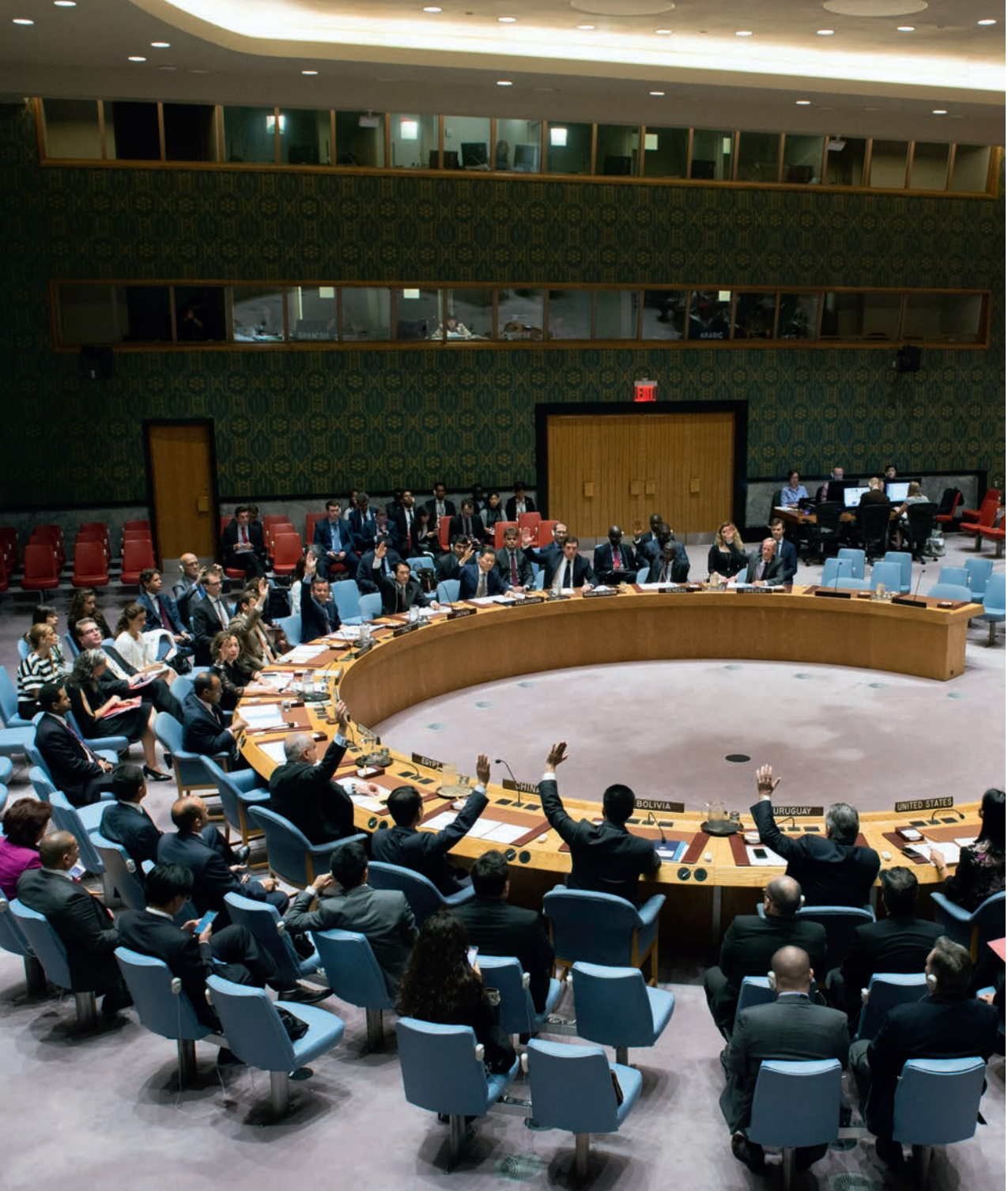
The UN Security Council unanimously adopts Resolution 2376 (2017), extending the mandate of UNSMIL, New York, 14 September 2017.

be responsive to the needs of partners. The sections below outline how we are currently prepared to support mediation efforts, which for the purpose of this report are understood broadly to include mediation, facilitation and dialogue. ■