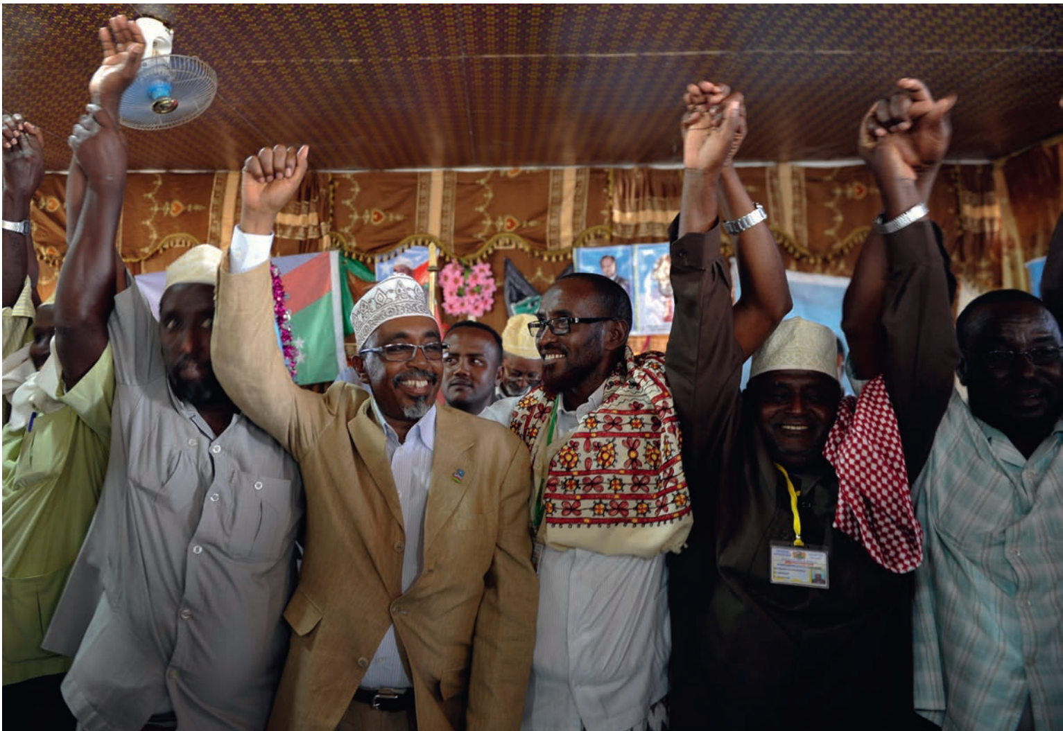
Sharif Hassan Sheikh Adan (centre), the leader of the Interim South West Administration (ISWA), and clan elders jubilate after a successful reconciliation conference aimed at stopping inter-clan fighting in Afgoye, Somalia, 27 January 2015.

10. Fourth, peace agreements are under increasing strain and are frequently punctuated by relapses into conflict, a tragic phenomenon which has been witnessed in South Sudan. Sometimes, this is associated with a rushed and flawed agreement; sometimes, failed agreements reflect the distractedness of the international community which may have moved on to the next conflict or is unable to maintain a coherent line of support. Reaching an agreement is only the first stage in a longer process: implementation also requires sustained assistance, both financial and political. The actions — and inaction — of other States can help reinforce a mediated solution or detract from its success.