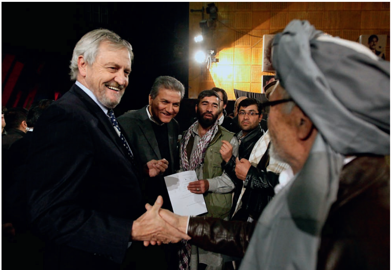
Afghan representatives debate the role of the UN role in the country with former UNAMA Head of Mission Nicholas Haysom, Kabul, Afghanistan, 15 December 2014.

31. The United Nations Secretariat houses various specialized units which provide technical support to mediation processes. The Department of Peacekeeping Operations Office of Rule of Law and Security Institutions provides support on issues such as disarmament, demobilization and reintegration and security sector reform, while its Office of Military Affairs advises on the implementation of ceasefires and security guarantees. For example, a permanent expert on disarmament, demobilization and reintegration was embedded within the Office of the Special Envoy for Yemen to support the De-escalation and Coordination Committee. The Electoral Assistance Division of the Department of Political Affairs has supported the Syria process by pro-