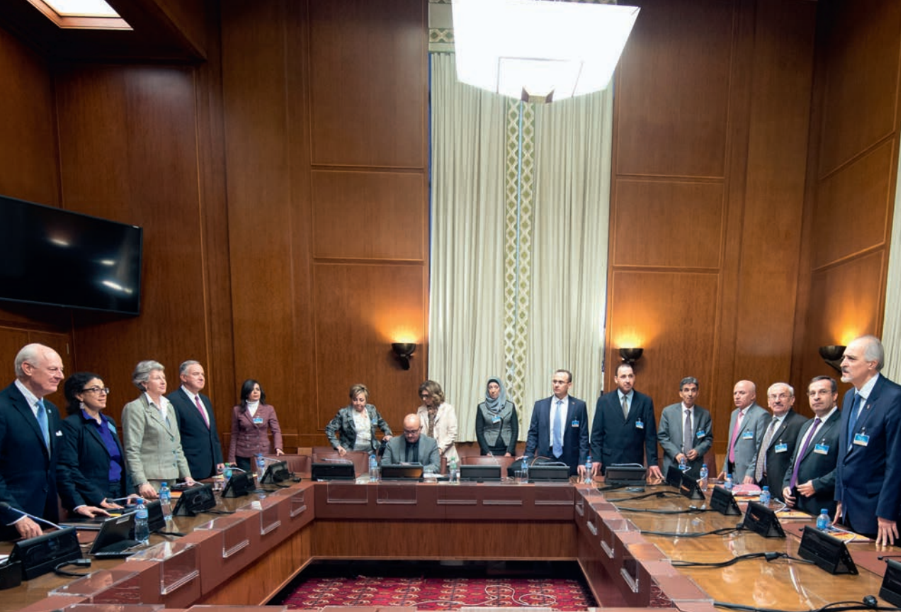
UN-mediated intra-Syrian talks begin in Geneva, Switzerland, on 29 January 2016.

the peace agreement. The United Nations Mission in Liberia (UNMIL) and the Peacebuilding Support Office have been supporting the establishment and functioning in that country of peace committees, hybrid structures designed to empower local leaders and communities to mediate, manage and settle conflict at the community level. In Colombia, over the past decade, and in anticipation of a peace agreement, UNDP built regional networks of over 700 civil society organizations in sectors impacted by the armed conflict. These networks, which include ethnic minorities, displaced populations, women and farmers' associations, have helped organize and empower civil society to contribute to sub-national development and peacebuilding.