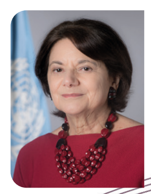
Rosemary A. DiCarlo Under-Secretary-General for Political and Peacebuilding Affairs

This joint effort illuminates the power and potential of dialogue and rights, and demonstrates that successful peacemaking embraces the fundamental rights of all parties involved, including those most marginalized. By integrating the mediation process with human rights considerations, we hope and aspire to increase the odds of reaching more inclusive and just peace agreements, which in turn, contribute to a more sustainable peace.