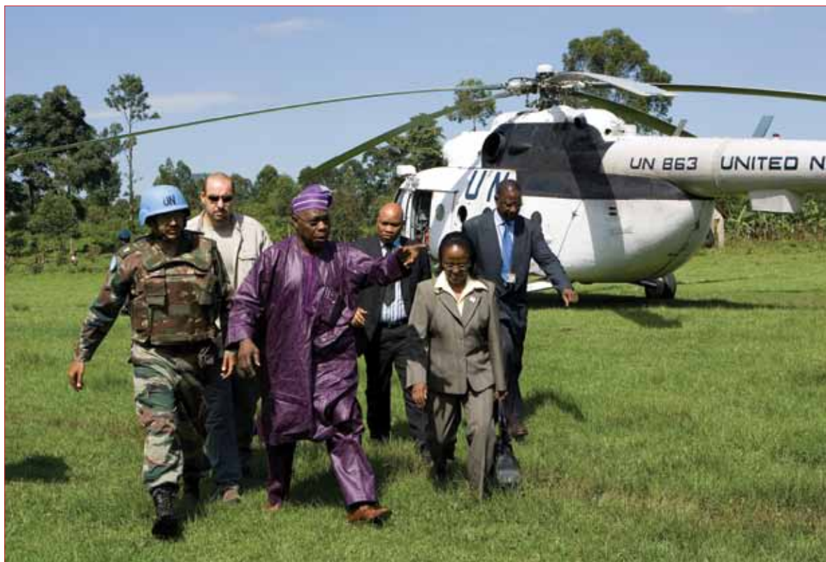
Olusegun Obasanjo (third from left), United Nations Special Envoy of the Secretary-General on the Great Lakes Region, in the Democratic Republic of the Congo, 2008.