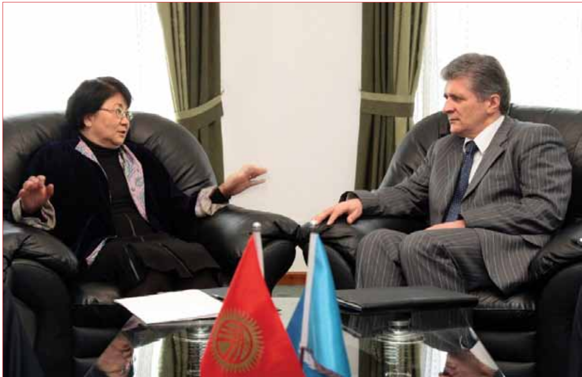
Special Representative for Central Asia, Miroslav Jenca, with the President of Kyrgyzstan, Roza Otunbayeva, 2010.