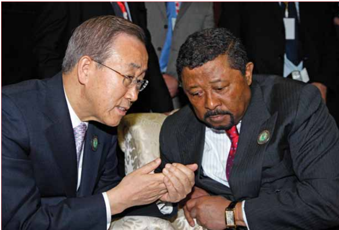
Secretary-General Ban Ki-moon and Jean Ping, Chairperson of the African Union Commission.