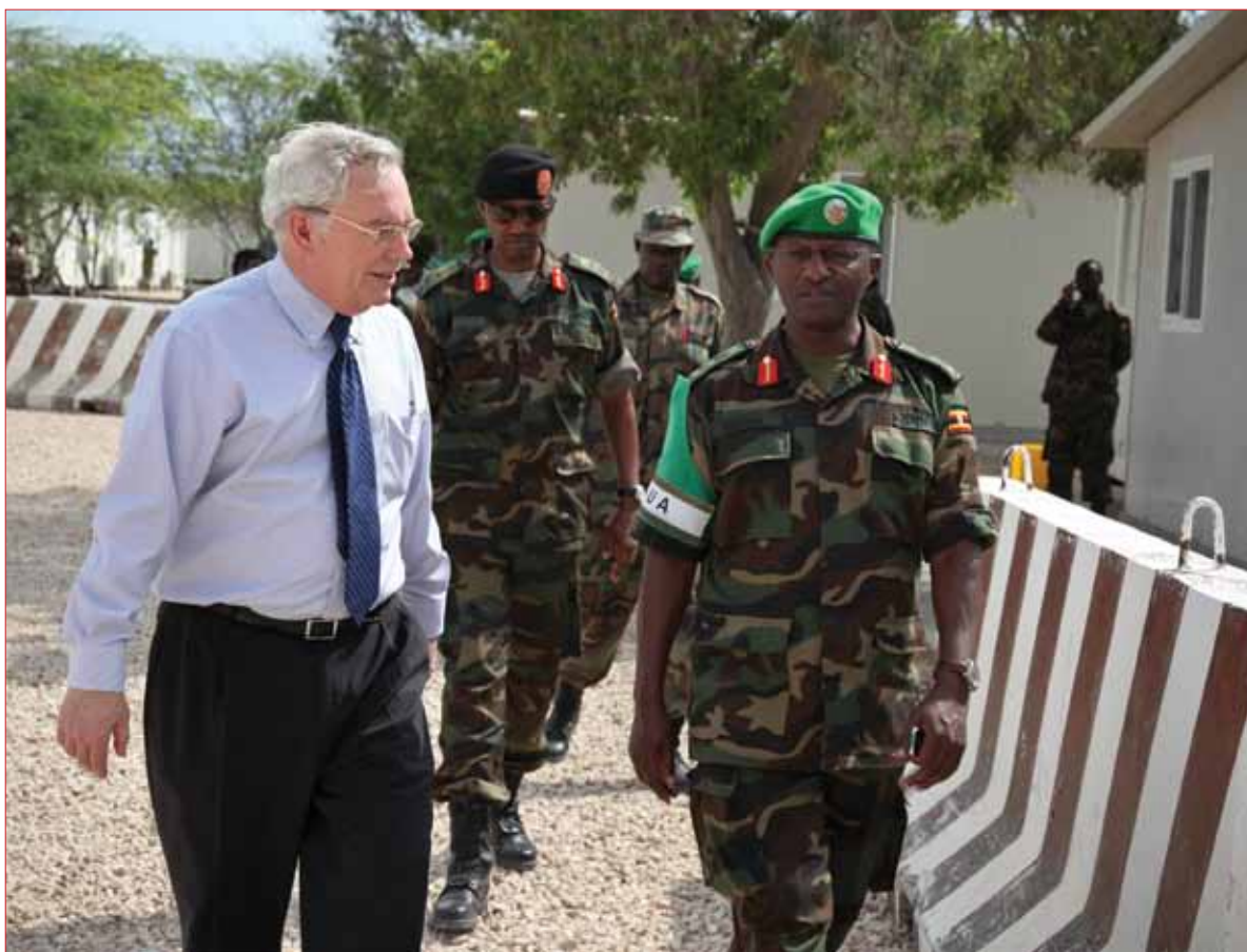
Under-Secretary-General for Political Affairs, B. Lynn Pascoe, in Somalia.