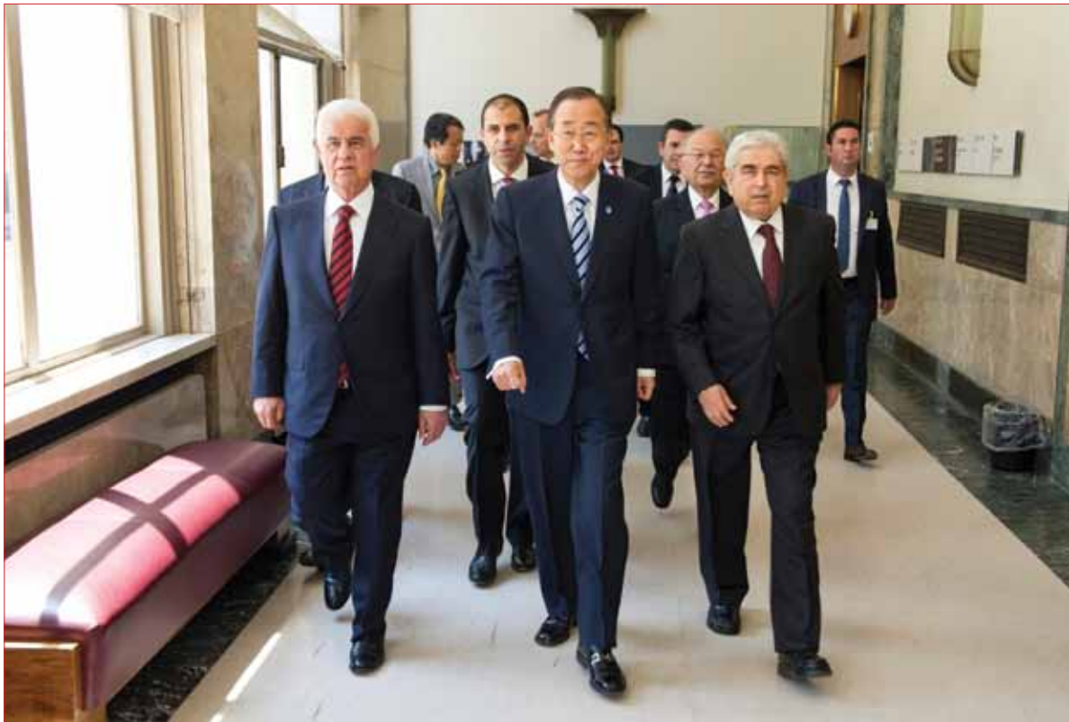
The Secretary-General with the Greek-Cypriot leader, Demetris Christofias (right) and the Turkish-Cypriot leader Dervis Eroglu (left) at the Geneva talks of July 2011.