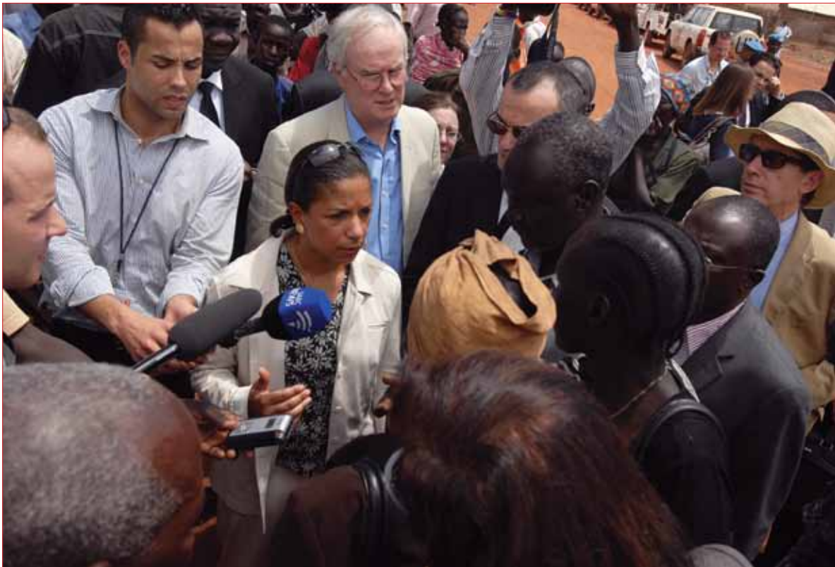
Members of the Security Council visiting South Sudan during May 2011 to encourage a peaceful move to independence.