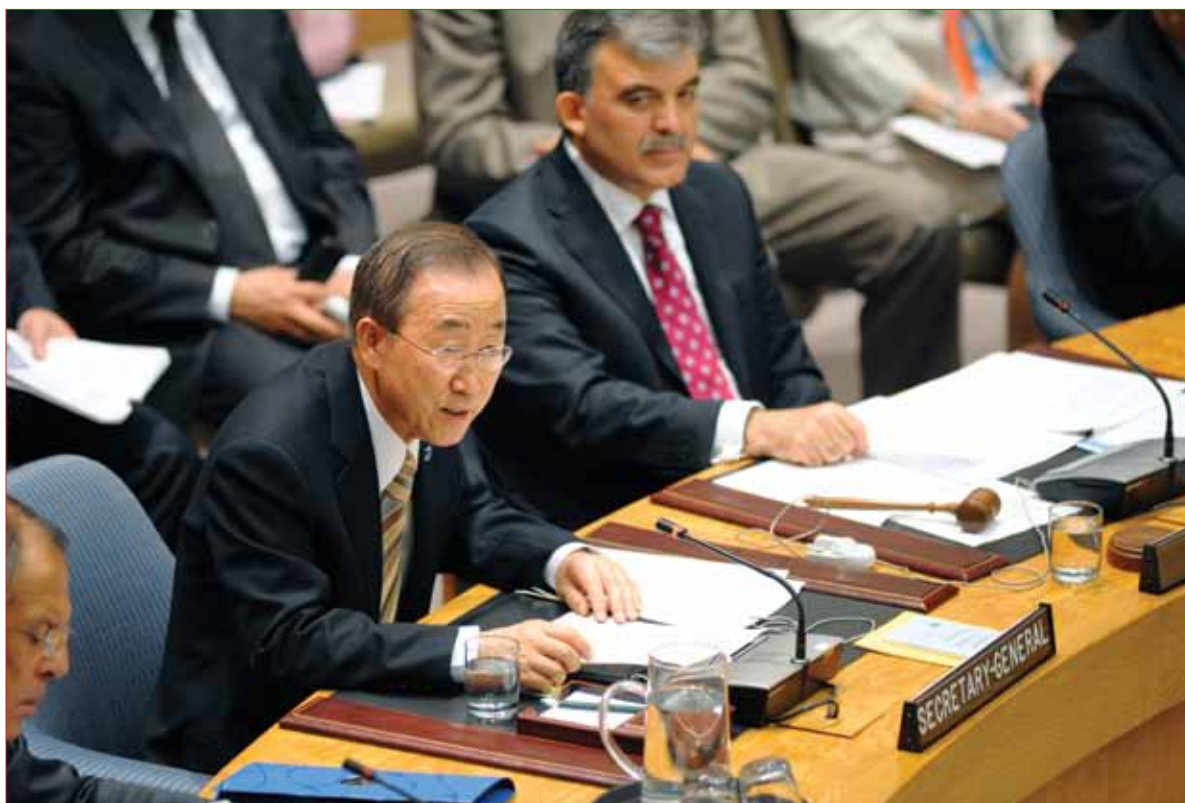
The Secretary-General briefing the Security Council.