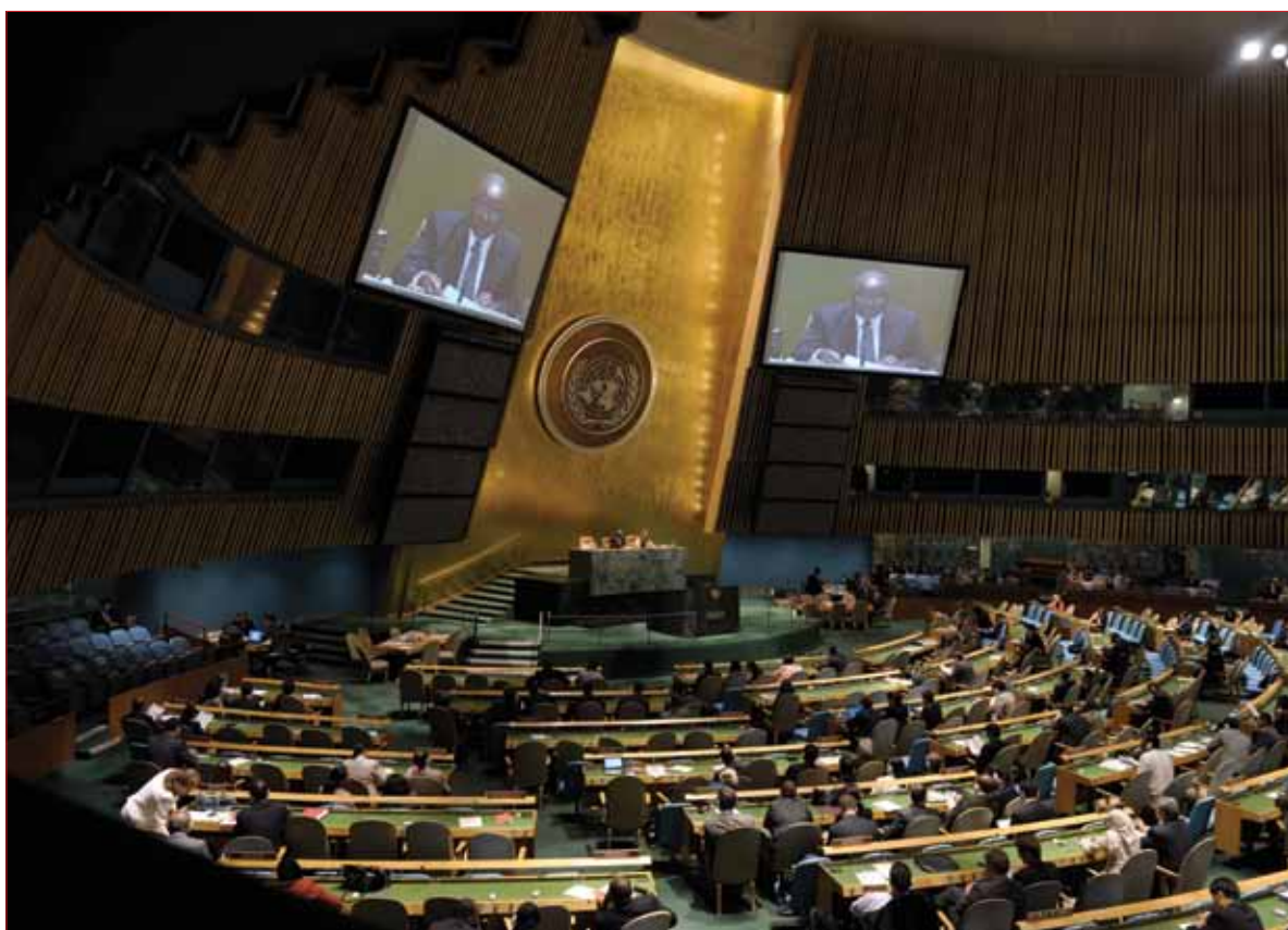
The General Assembly has a central role in contributing to a conducive environment for conflict prevention.