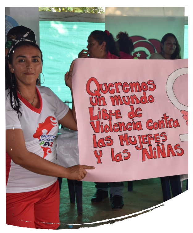
Women FARC-EP former combatants shared their experiences in a gathering to verify the Gender Perspective in the Peace Agreement. Tierra Grata, Manaure, Cesar.