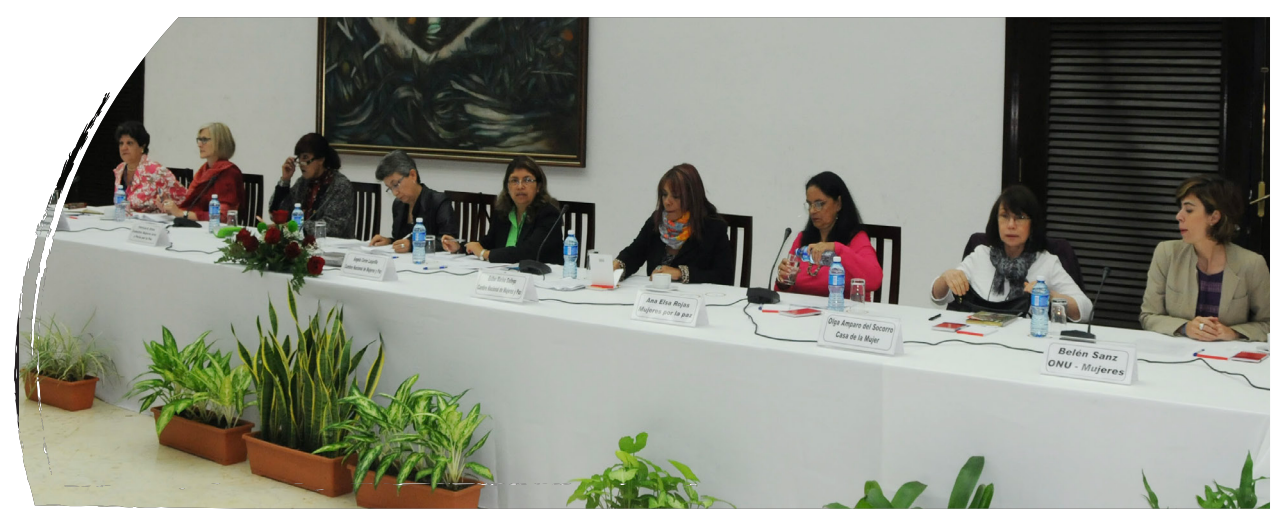
Meeting of the Gender Sub-commission of women in Havan with representatives of women's organizations.

The early experience of the GSC opened the way for women's participation in another key sub-commission, this time on issues usually dominated by men. The Sub-Commission on agenda item 3, "End of Conflict," was tasked with developing proposals on matters generally referred to as demobilization, disarmament and reintegration. In their delegations to this Sub-Commission, the FARC-EP included three women with strong military experience and the Government included two women officers. While their role was not restricted to the gender content of the proposals, in one very significant development, women members of the Sub-Commission, with strong support from the UN Delegate to the Sub-Commission (see below), ensured that acts of gender-based violence were included in the list of actions that, if committed by either of the parties, would constitute a ceasefire violation.