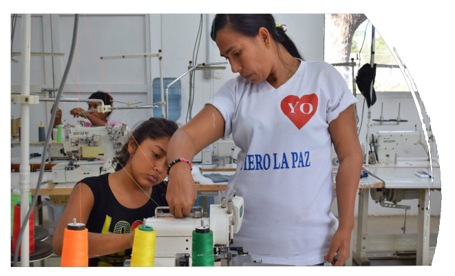
Fariana Confecciones a productive project. Former TATR Pondores, Fonseca, La Guajira, Colombia.

Early problems were related in part to the lack of an official reintegration policy. Different visions on the issue were brought to the Havana negotiations, and few details were included in the Peace Agreement.<sup>35</sup> Instead, the Agreement created the National Reincorporation Council (CNR), with two members each from the Government and the FARC,