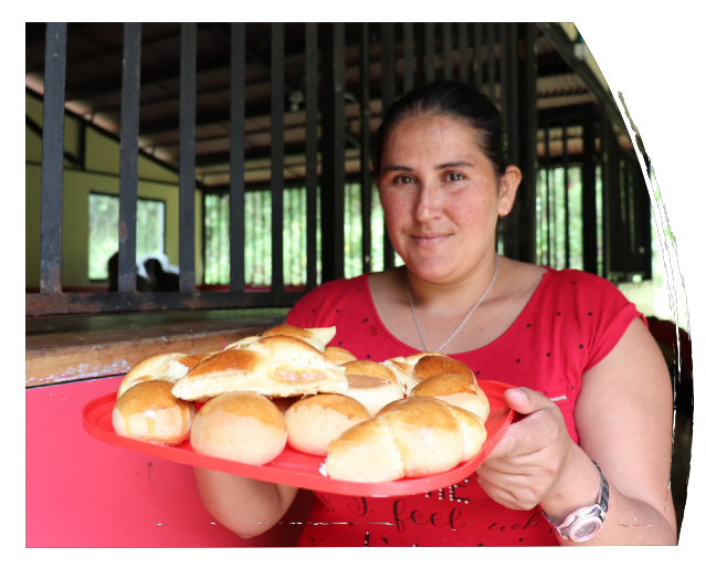
In the former Territorial Space for Training and Reintegration of Santa Lucía, Ituango, women played a key ole in the development of productive projects such as bakery. Santa Lucía, Ituango, Antioquia.

care, as well as sexual and reproductive health. In addition, childcare issues continue to be a barrier, limiting women's participation in vocational training, formal education, productive projects and political activities. The Mission, together with UN Women and other UN agencies, has therefore worked closely with the FARC Gender Commission to support the FARC's model for community care giving and has advocated with the Government that day care facilities be created to respond to their needs. Nine such facilities had been set up by the end of 2019; many more are still needed in areas where groups of former combatants have settled and are trying to create new lives. A project supported by the UN Peacebuilding Fund, working with the Government, FARC and the UN, has been critical to establishing day care facilities adapted to the "economy of care" model developed by the FARC Gender Commission.