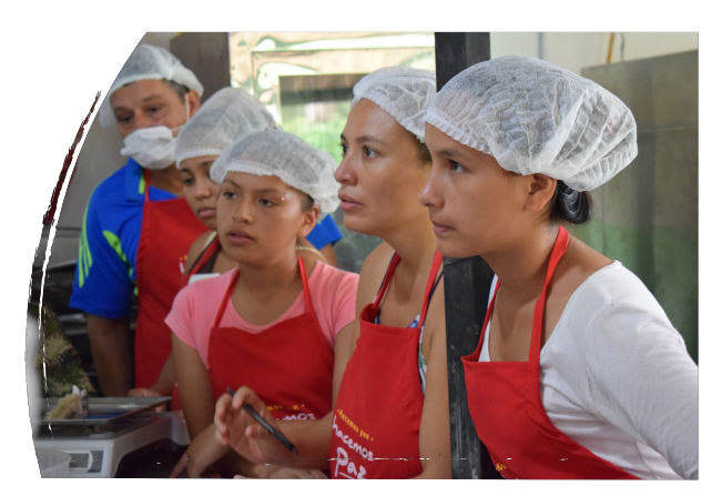
Female ex-combatants and women from the communities learn bakery. La Montañita, Caquetá, Colombia

In addition to the CNR/GTWG the gender technical structures in the Agency for Reintegration and Normalization (ARN) and the Presidential Council on Stabilization and Consolidation (CPEC) are important counterparts for the Mission with the Government.