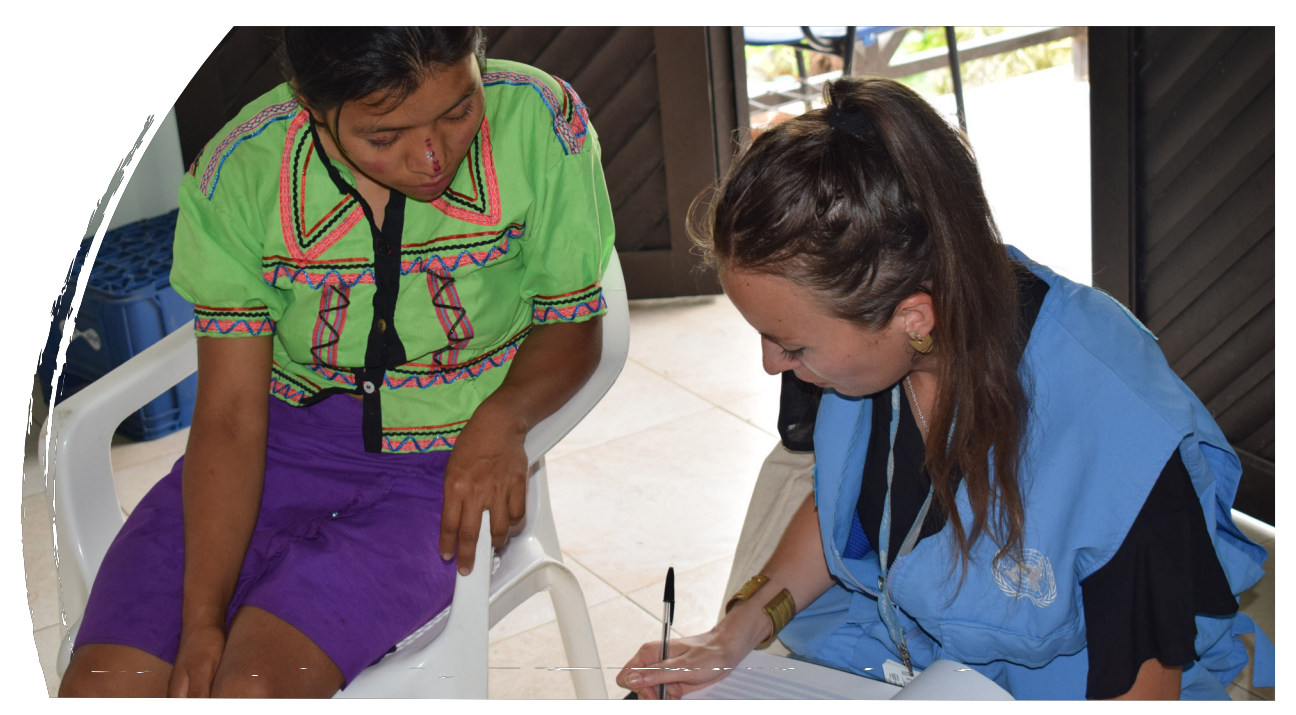
The ethnic approach in the Peace Agreement has been one of the topics addressed during the strategic dialogues organized by the Dabeiba Cabildo Mayor. Dabeiba, Antioquia.