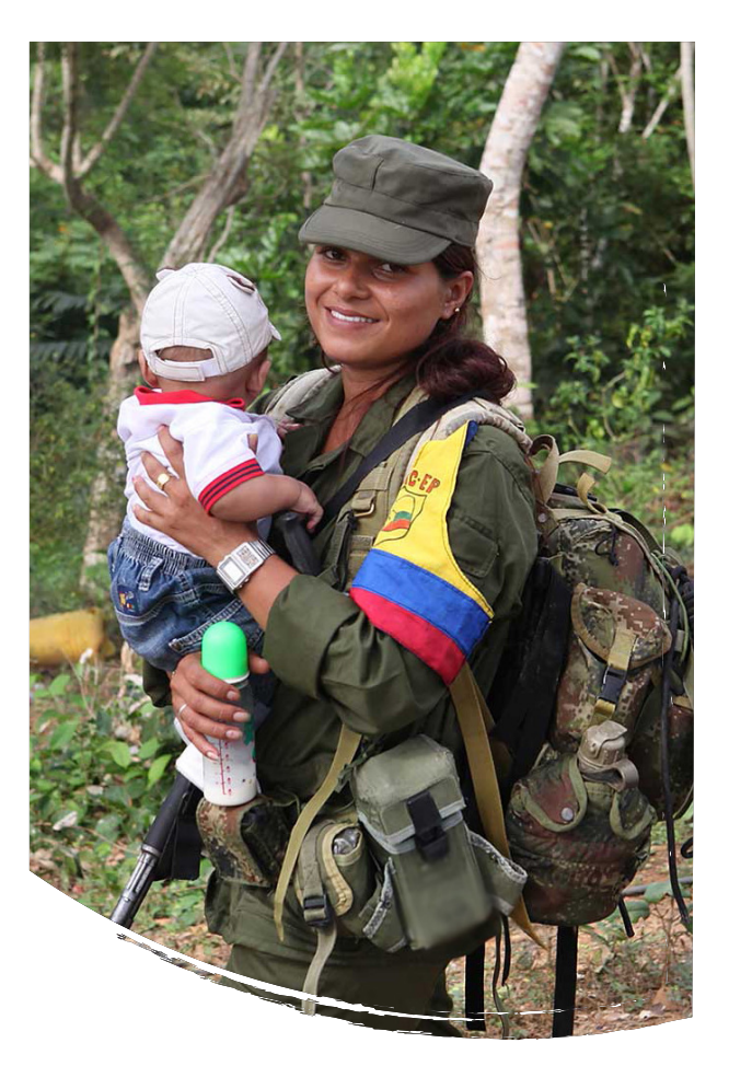
Female combatant of FARC-EP along with her baby reaching the a Normalization Zone (ZVTNs), territories where FARC-EP combatants laid down their arms and began transition to civilian life.

A similar lack of planning for childcare facilities in some cases limited women's participation in educational and political activities, with many women former combatants quickly falling back into a life of domestic tasks. This situation, together with the strong cultural pull of traditional gendered roles in rural Colombia, made it difficult for many women former combatants to participate in early initiatives for economic reintegration, circumstances that continue to impede their participation today.