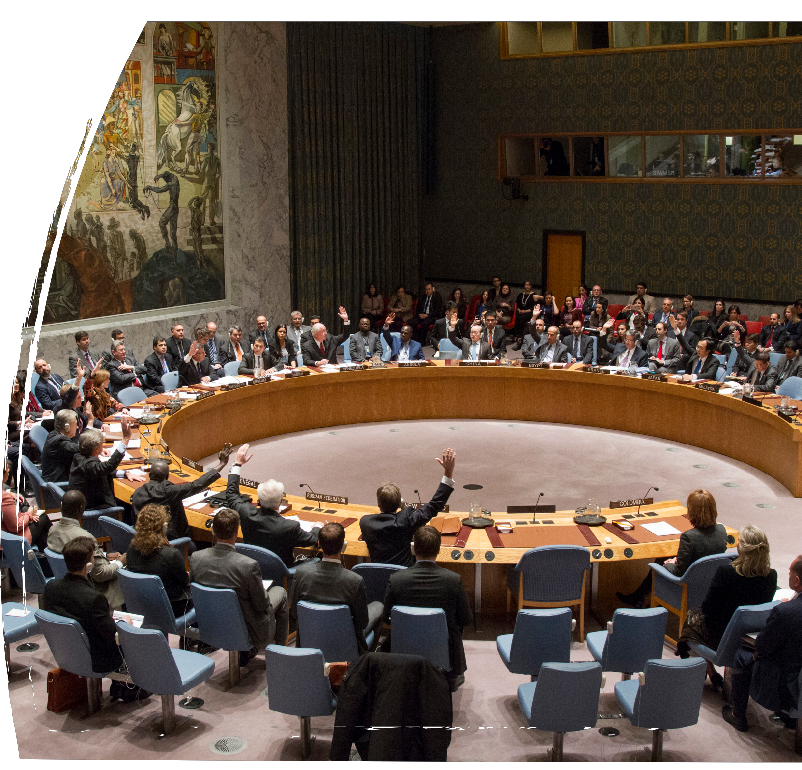
A broad view when the Security Council members voted unanimously to adopt the resolution 2261. 25 January 2016. United Nations, New York.