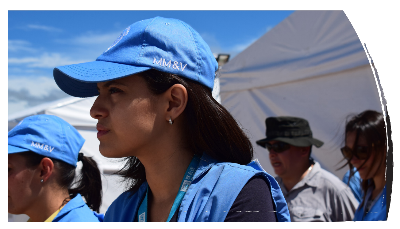
Women as part of the Tripartite Monitoring and Verification Mechanism for lay down of weapons.