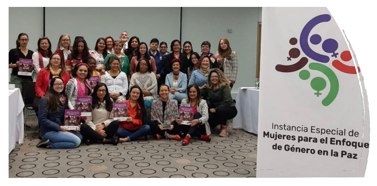
Meeting of the Special Forum on Gender with Government representatives, civil society and international cooperation for the presentation of their annual report on the progress of the implementation of a gender sensitive peace agreement. (2019)

At the same time, they began to reach out to women in different FARC-EP structures and lay the foundations for what is today a strong network of women activists in the party at the local, regional and national levels. In Havana, the women got approval from the mostly male FARC-EP leadership to create the Gender Commission as a formal part of the organization, and later had the Commission recognized as part of the new FARC political party. Now an essential counterpart for the UN nationally and locally, the FARC Gender Commission plays a critical role in advancing the gender and women's rights content of the Agreement, while at the same time fighting against women's marginalization.<sup>15</sup>