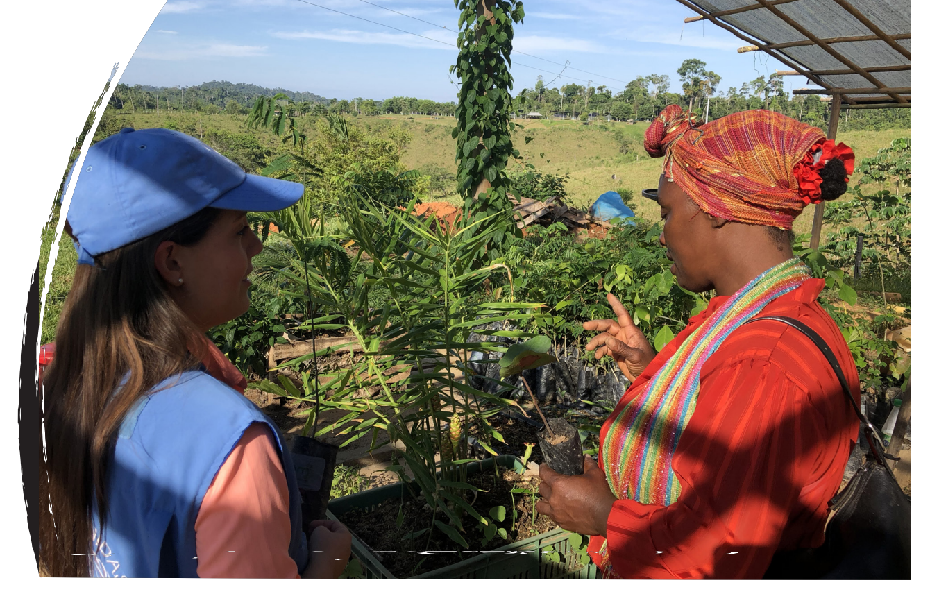
The Peace Agreement has allowed encouraging constructive dialogue between former combatants and indigenous and Afro-descendant communities. Carrizal, Remedios, Antioquia.