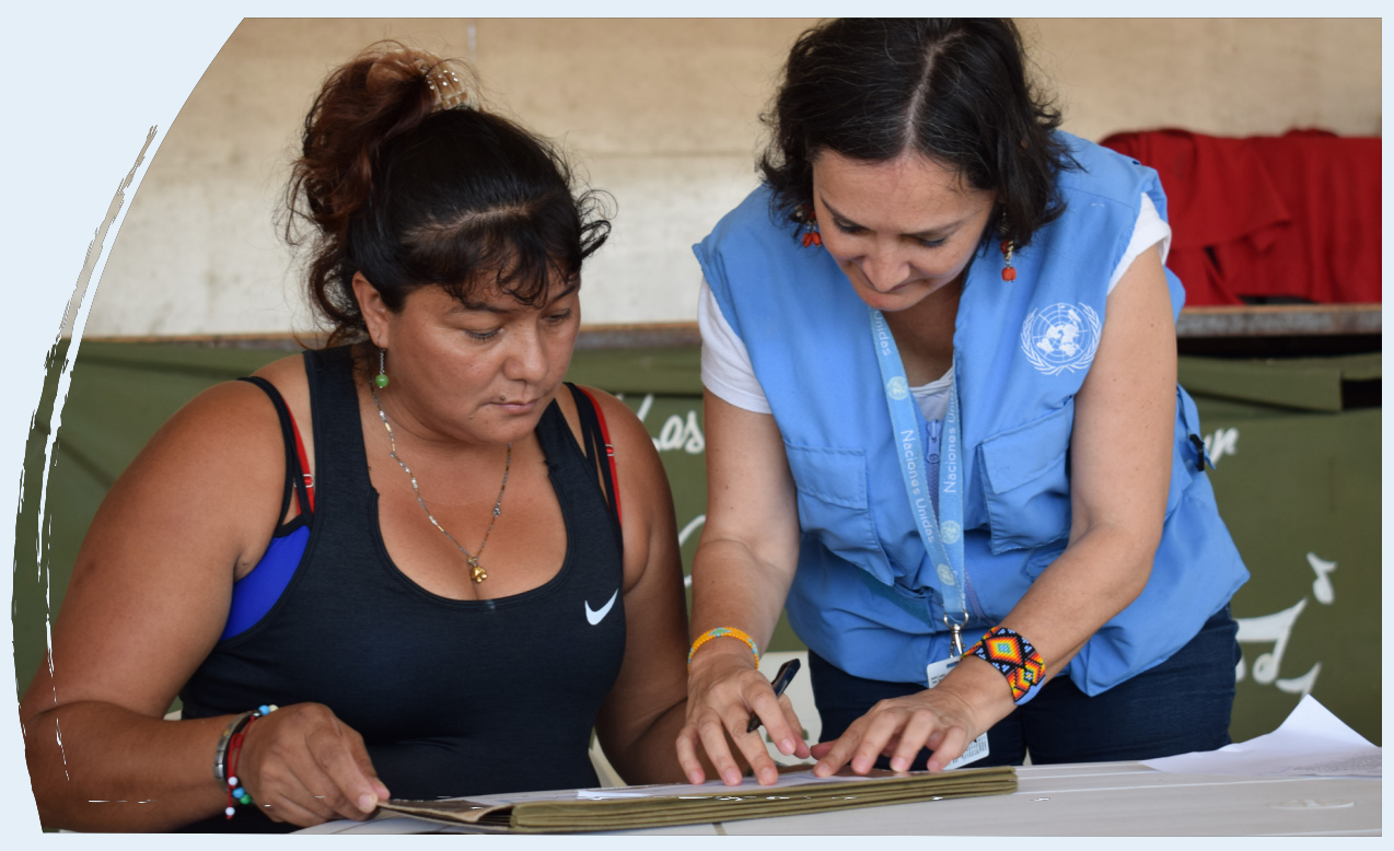
ASOMIC Association signs agreement for the fishing project in Former Reintegration Area La Pradera. Puerto Asís, Putumayo, Colombia.