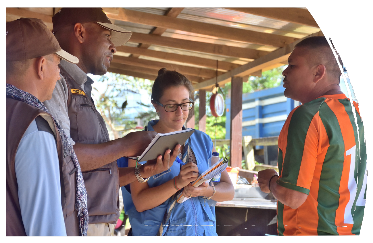
Women from the UN Mission in Colombia had a key role in the tripartite Mechanism for Monitoring and Verification, created during the laying down of weapons.

police officers), much limited by the fact that women in the military at that time lacked the opportunity to have accumulated the type of field deployment experience required; the FARC component was approximately 18 per cent women.