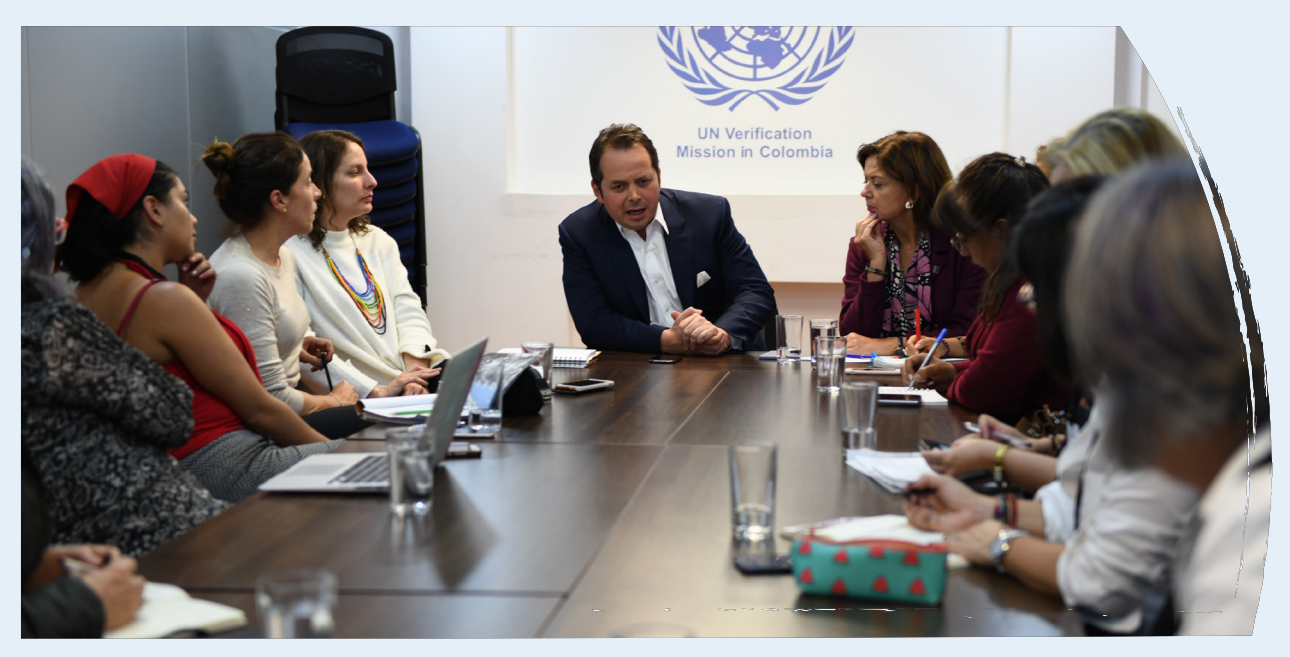
The Special Representative of the Secretary-General (SRSG) and Head of the UN Verification Mission in Colombia holding his regular meeting with representatives of women's organisations, accompanied by the country representative of UN Women.